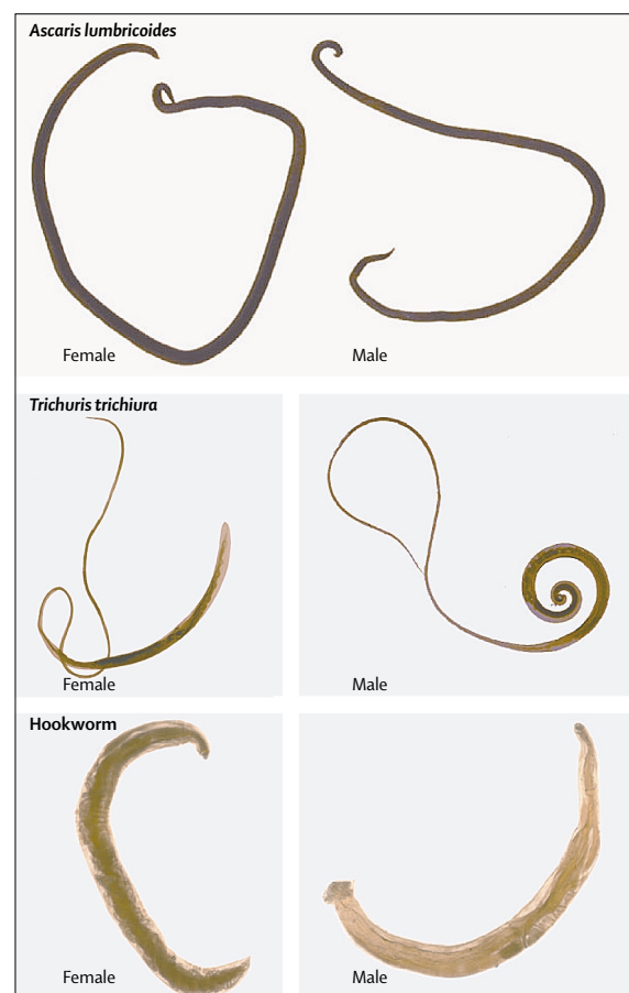
Figure 1: Adult male and female soil-transmitted helminths Reproduced with permission. 10

Soil-transmitted helminth infections are widely distributed throughout the tropics and subtropics (table 3). Climate is an important determinant of transmission of these infections, with adequate moisture and warm temperature